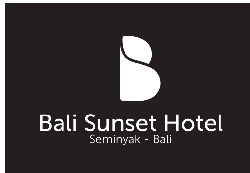
Black White Version