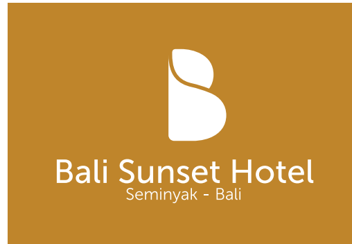
White Scale Version