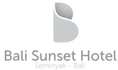
Grey Scale Version