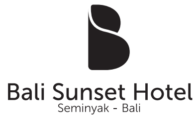
Black White Version