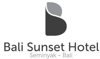
Grey Scale Version